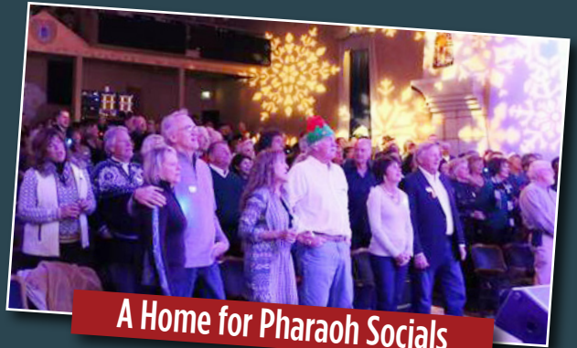
A Home for Pharaoh Socials