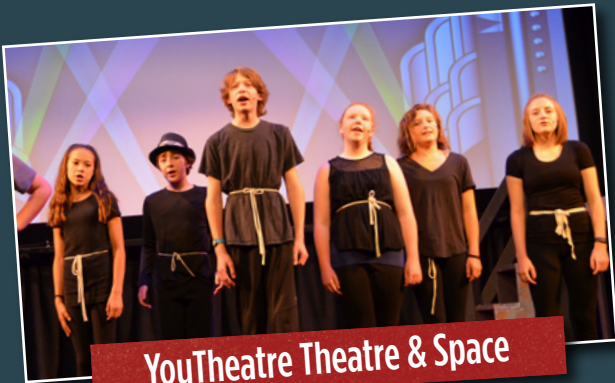
YouTheatre Theatre & Space

Egyptian Theatre + YouTheatre Space + Black Box Theatre + Event space